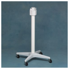
30 In. Roll stand