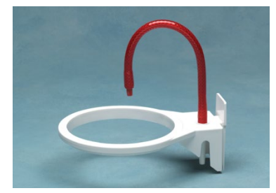
Guardian™ Ring Bracket

Reusable ring brackets are constructed of durable polycarbonate for years of maintenance-free use. Brackets slide into a wall plate or roll stand.