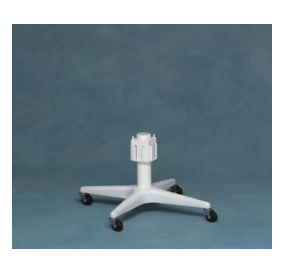
11 In. Roll stand

Roll stands allow flexibility in the location and configuration of Medi-Vac<sup>®</sup> Canister (CRD<sup>™</sup>, Flex Advantage<sup>®</sup> or Guardian<sup>™</sup> Systems) installations.