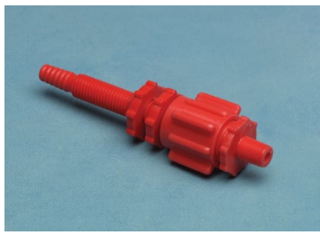
Universal female D.I.S.S.

Allow use with standard vacuum regulator Diameter Index Safety System (D.I.S.S.) connections.