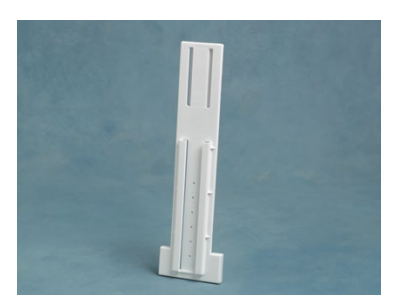
Variable height adapter

Attachment devices for use with ring brackets.