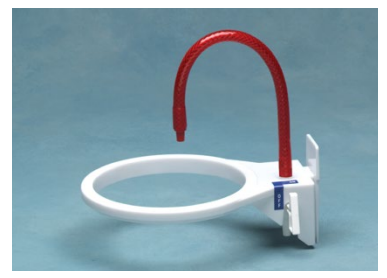
Guardian<sup>™</sup> Ring Bracket with built-in on/off valve