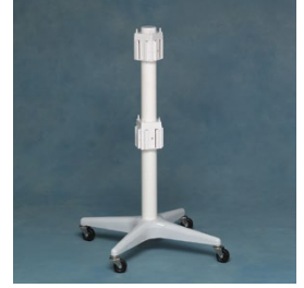
30 In. Eight-canister dual-head roll stand